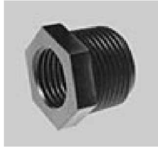
Illustration Only Please call for specific part drawing