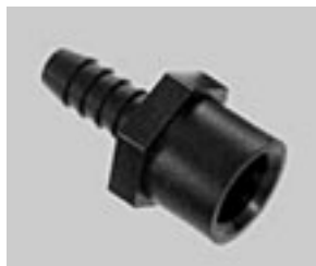
Illustration Only Please call for specific part drawing