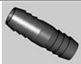
Illustration Only Please call for specific part drawing