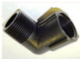
Illustration Only Please call for specific part drawing