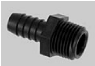
Illustration Only Please call for specific part drawing