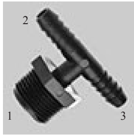
Illustration Only Please call for specific part drawing