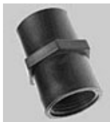
Illustration Only Please call for specific part drawing