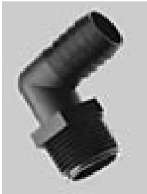
Illustration Only Please call for specific part drawing