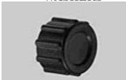
GARDEN HOSE CAP