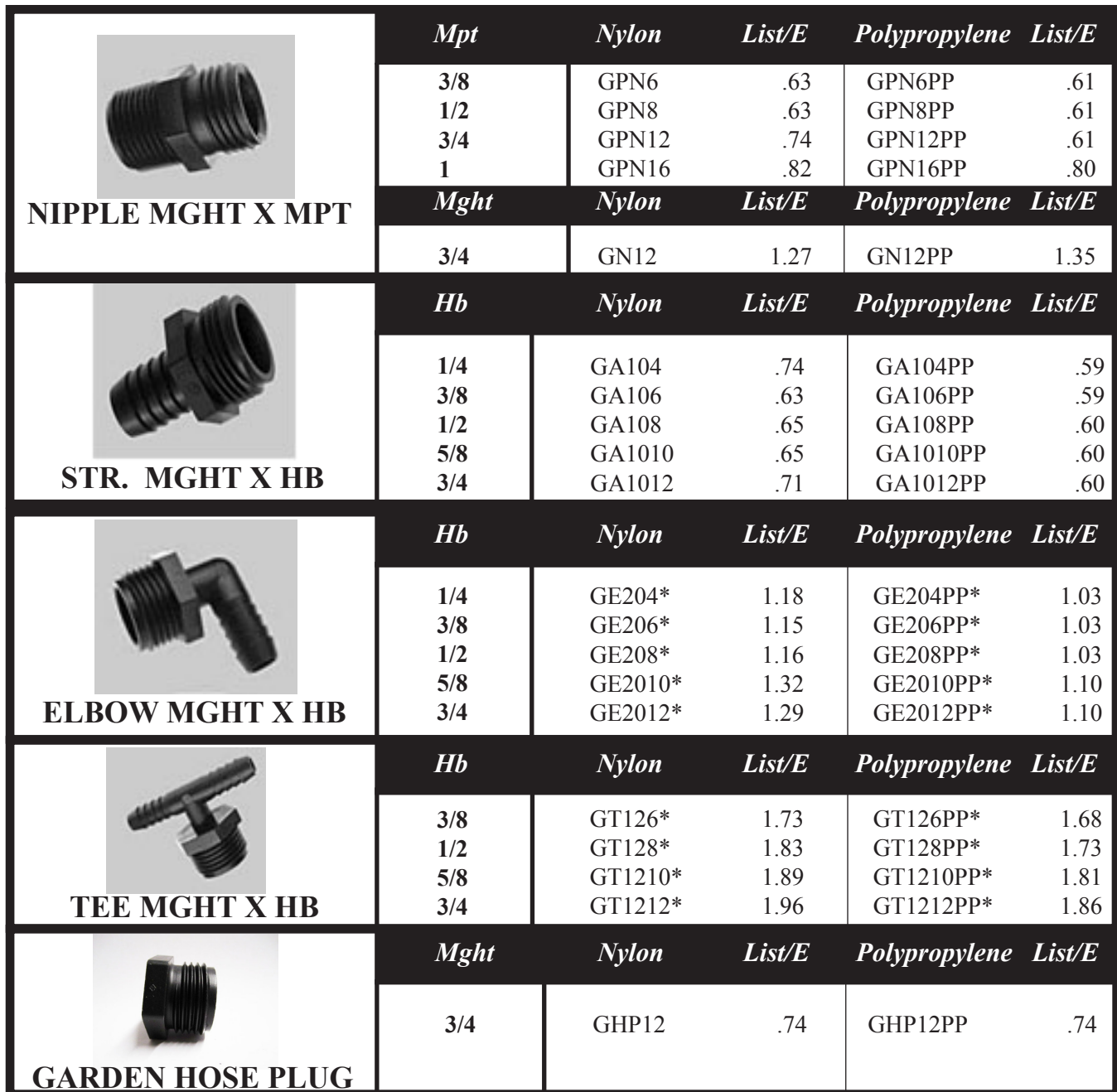
Illustration Only Please call for specific part drawing