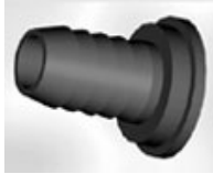
SW NUT HB INSERTS